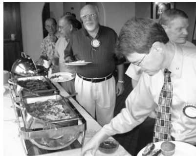
Searching for missing French Toast